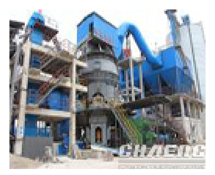
600,000 t/a GGBFS Plant for Xinji Gangxin Cement Co., Ltd