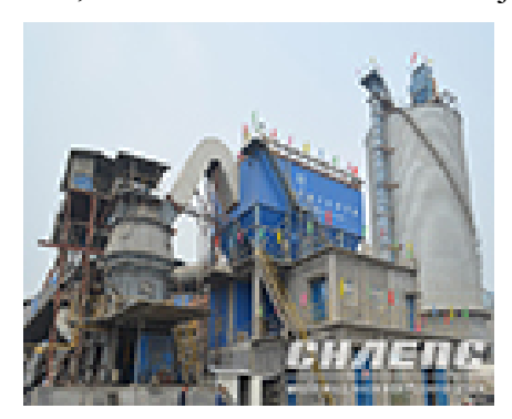
900,000 t/a GGBS Plant of Hongyan Building Materials Co., Ltd.