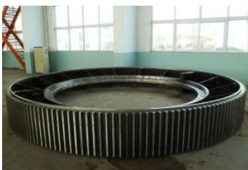
Ball mill gears