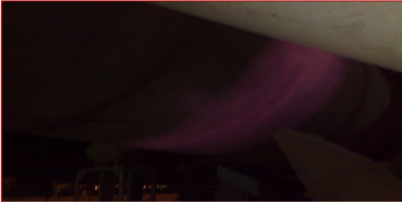
Figure-2: Hot spot with a temperature of 570°C

Red spot (figure-3) differ from hot spot in that it is visible at night. While a hot spot is just a warning, a red spot always demands some kind of action from the kiln operator.