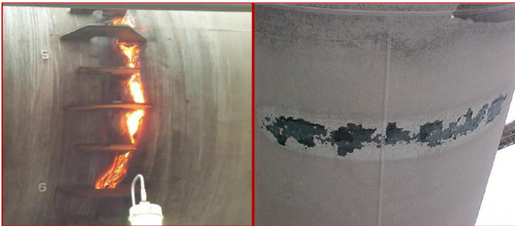
Figure-4: Circumference red spot