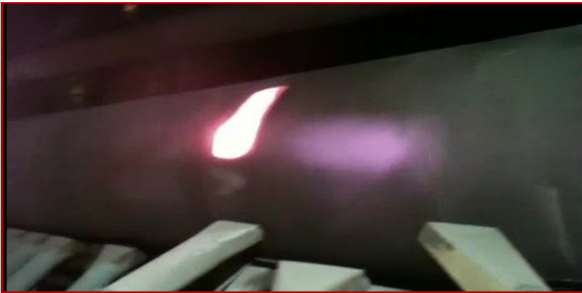
Figure-3: Red spot with 830°C temperature