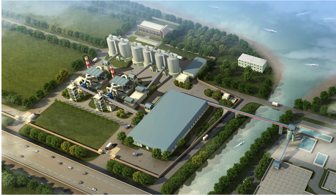
Active lime production line