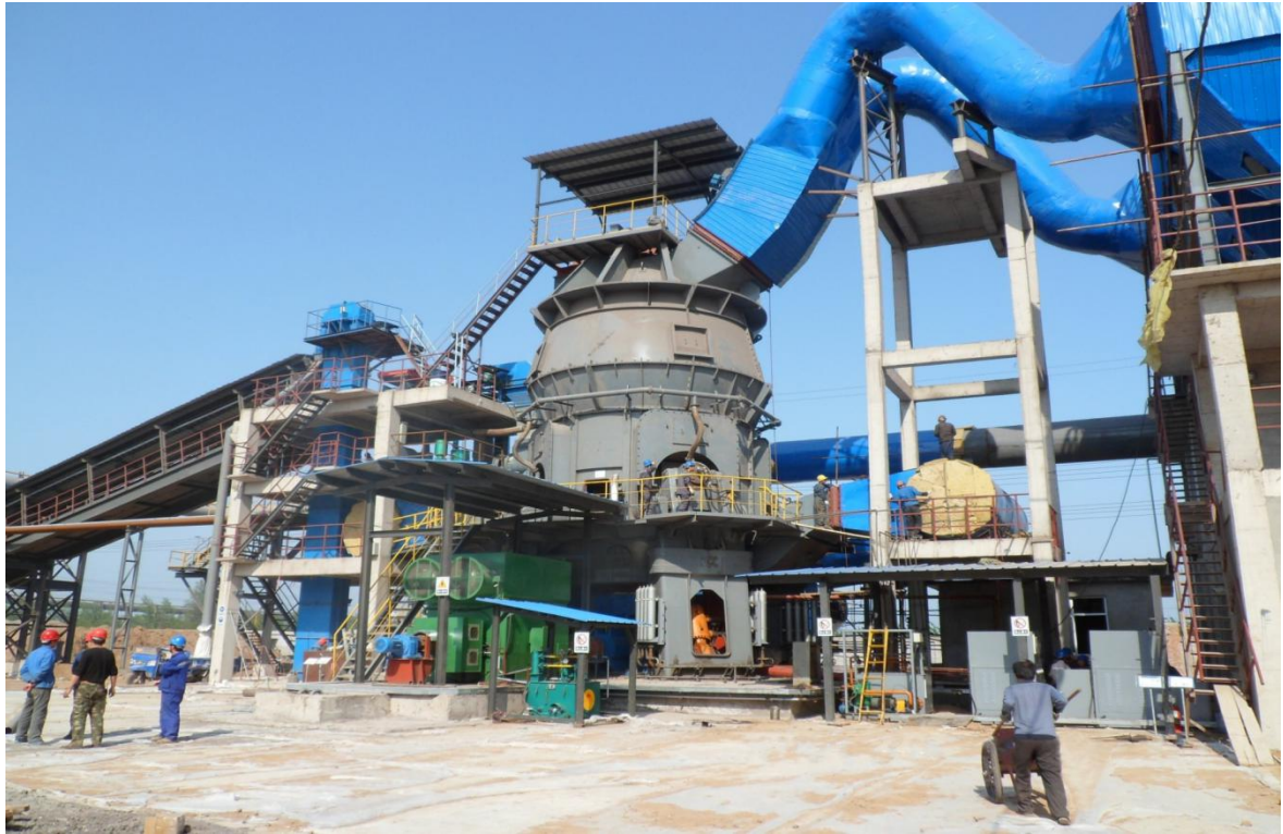
EPC project of Tengxin Technology 2x300000 T/A nickel slag line