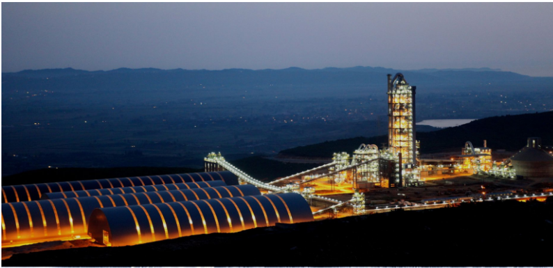
EPC project of Yu Hui building materials 900000 T/A cement